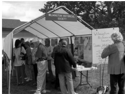
Festival of Colors booth 2008