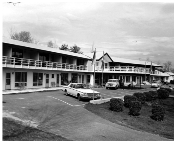
Holiday Motor Inn- 1960's. Now Whiteface Corners & Twisted Raven Restaurant

You are invited to become a 2024 member of the Wilmington Historical