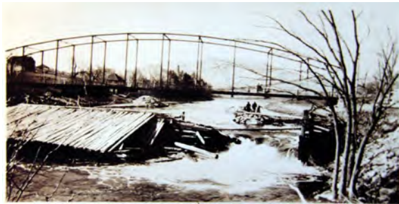
Breach of dam 1920's

The mission of the Wilmington Historical Society is to preserve and interpret the documents, photographs and artifacts that enable us to engage, educate and share with residents and visitors the unique stories and local culture of Wilmington, the Whiteface Mountain Region and the greater Adirondack Community.