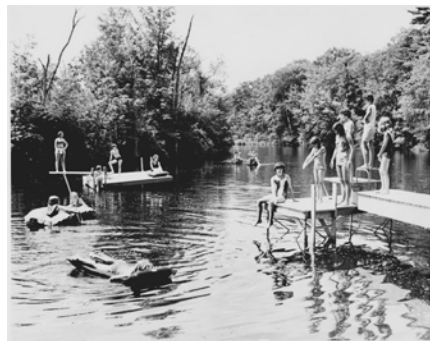
Camp Whiteface Mountain- swimming ca 1960's