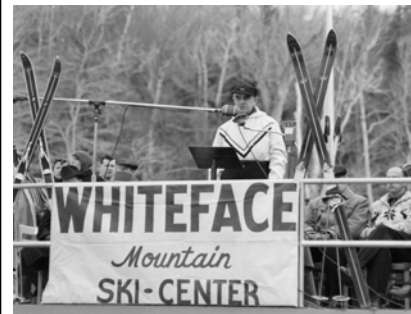
Gov Averill Harriman dedicates Whiteface Mountain 1950 -

Please consider a donation to the Wilmington Historical Society building construction fund. You may send a check (Memo line: construction fund) to Wilmington Historical Society, PO Box 174, Wilmington, NY or go to www.WilmingtonHistoricalSociety.org and click on Annual Appeal. Your gifts may be tax deductible. Keep in mind that this kind of donation is also a great way to memorialize or honor a loved one. Planned giving through your will, trust or estate plan is also an option.