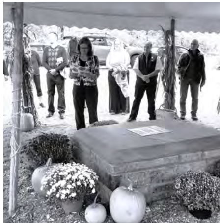
Time Capsule buried Sept. 17, 2022 to be opened Sept. 17, 2072

You are invited to become a 2023 member of the Wilmington Historical Society