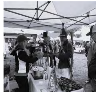
Whiskey Run Festival-Whiskey Tastings-Battle of Plattsburgh re-enactors at Murray's Fools Craft Distillery

and click on Annual Appeal . Your gifts may be tax deductible. Keep in mind that this kind of donation is also a great way to memorialize or honor a loved one. Planned giving through your will, trust or estate plan is also an option.