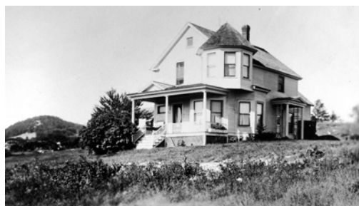
A Sears catalog house. Mail order delivery is nothing new for Wilmington