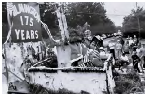
175th Anniversary Celebration of Wilmington

The mission of the Wilmington Historical Society is to collect, preserve, display and interpret the documents, photographs and artifacts that tell the unique story of Wilmington, New York and the Whiteface Mountain Region.